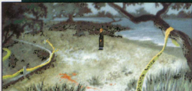
Once you're alone, check out those weird markings in the grass and that strange patch near the tree.

After you learn the location of the crime scene, you'll need to head on over there and give everything a close examination (you did remember to pick up the magnifying glass and tweezers