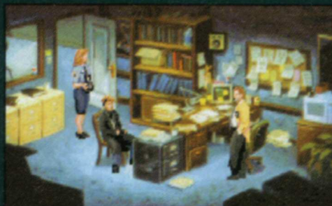
Don't forget to excuse yourself to fix your "hayah" before Officer Franks takes your picture.

If you've tried comparing the voodoo messages with the translations and still can't figure out what to write on the tomb wall, help is on the way. Using the red brick, write "DJ bring sekey madoule" on the wall. "DJ" is Dr. John, and he'll bring back the little coffin Gabriel placed the tracking device in.