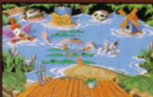
Once you've lined up those gators, have Sam hopscotch across their backs to release Max.

umn you'll see a fuse box that looks suspiciously dangerous. In order to keep Sam out of danger, use Max on the box as you go by, and the ride should stop. Now you need to find the switch to open the door to Doug the Mole Man's room. Max almost has the right idea tugging on that axe, but that won't get you into Doug's place. Have Sam give a tug on ol' King Henry's beard, and that door's gonna swing wide.