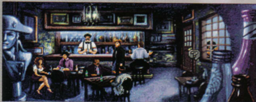
Visit famous New Orleans landmarks and enlist the help of locals.

It's his recurring nightmare—fire burning within two concentric circles; an ancient, magical medalion of gold; the face of a beautiful woman; dancing figures; the snake . . . Then he sees himself, hanging by the neck from the dead limb of a large tree. He wakes up screaming.